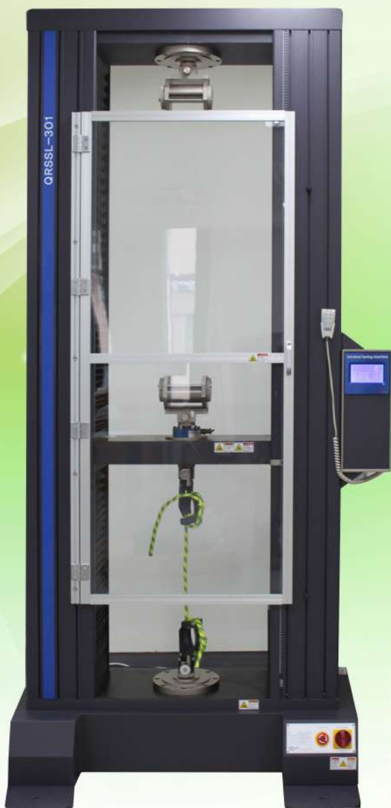
Model : QRSSL-301