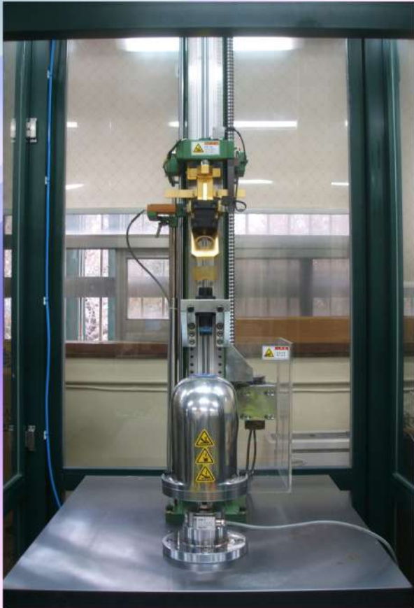
Model : QRSCI-302